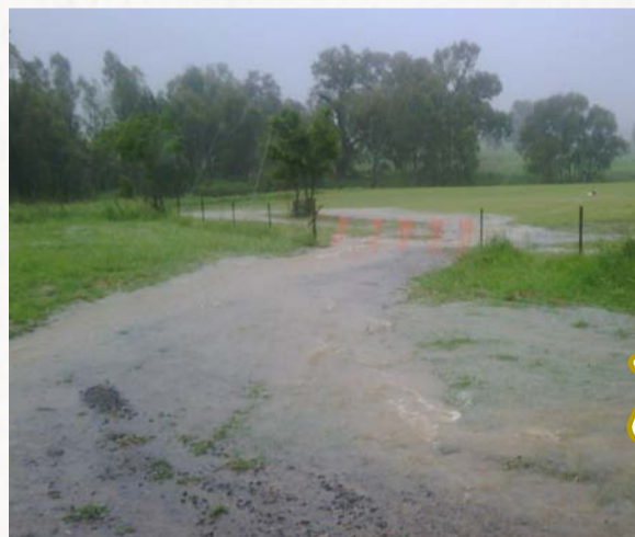
Water flowing into the Condamine River. Warwick Village remained above the flood peak.