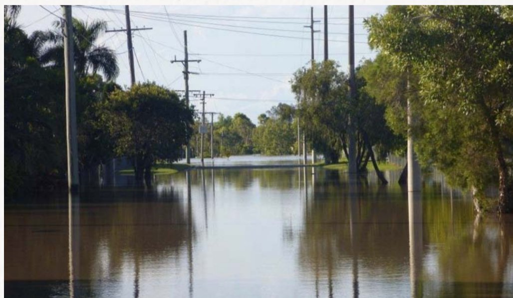
Flooding around Rockhampton. Park Avenue Village remained dry.

THANK YOU TO ALL OF OUR RESIDENTS FOR THEIR KIND GENEROSITY, AND TO ALL OF THOSE WHO SENT THEIR SUPPORT AND THOUGHTS DURING THIS TIME.